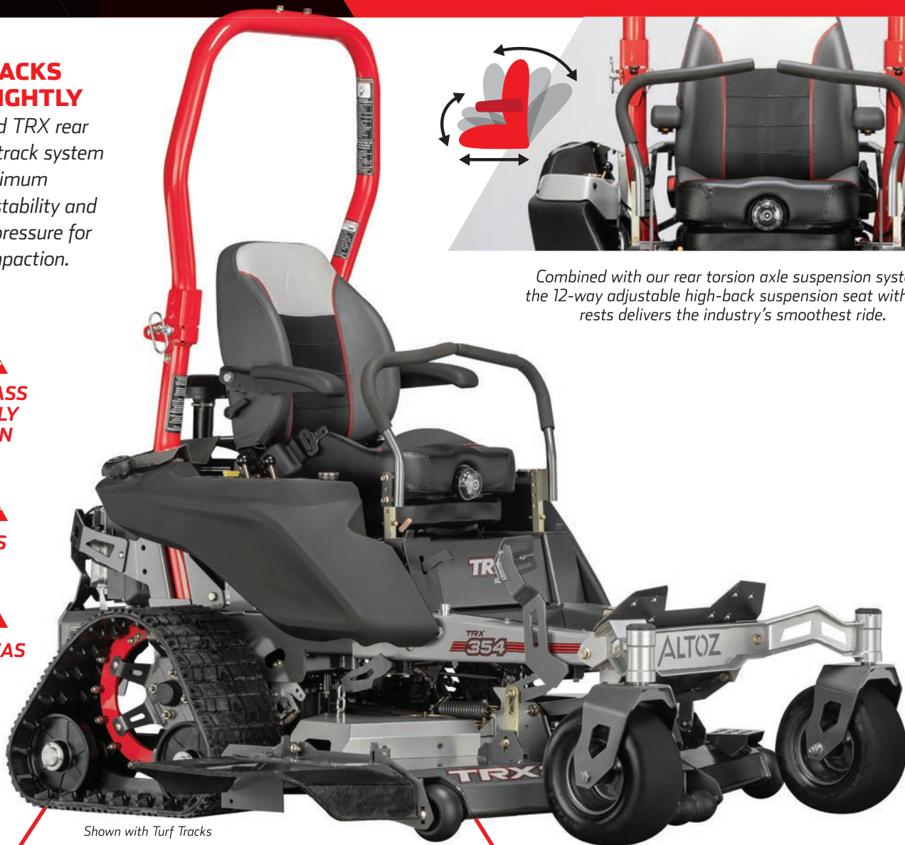
Shown with Turf Tracks